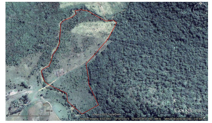
Fig.1. Independence Farm, Torixoréu, Mato Grosso, Brazil. (A) Green Niedenzuella stannea in a pasture of dry Brachiaria spp. (B) Cattle consuming leaves of N. stannea in August 2013. (C) Sprouts of N. stannea . (D) Flowers and fruits of N. stannea .

Inspection of the pastures was performed on 80 farms in the municipality of Torixoréu, Mato Grosso. The aim